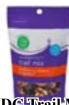
FDC Trail Mix Peanut Butter or Caramel 10oz-12oz $3.88