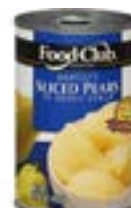
FDC Asst Fruit 15.25oz $3.88