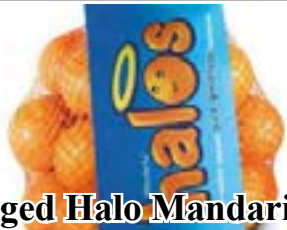
Bagged Halo Mandarin $3.99