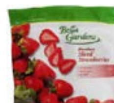
Bella Gardens Sliced Strawberries 16oz $3.48