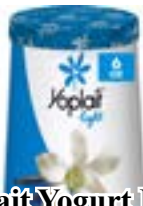
Yoplait Yogurt Light and Original Asst. 6oz 2/$1.00