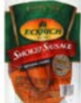
Echrick Smoked Sausage 39oz $9.99