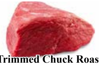
Trimmed Chuck Roast $3.99 lb