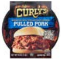
Curly's Bbq Pulled Pork 16oz $5.99