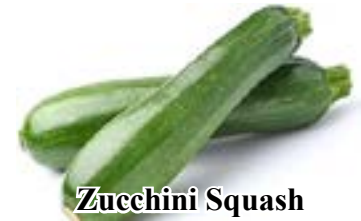
Zucchini Squash $1.39 lb