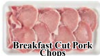
Breakfast Cut Pork Chops $1.99 lb