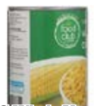
FDC Whole Kernel Corn 24oz $2.38