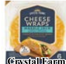
Crystal Farms Marble Jack Cheese Wrap 6oz $4.88