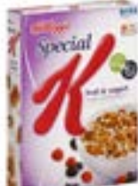
Kellogg's Special K Fruit and Yogurt $3.98