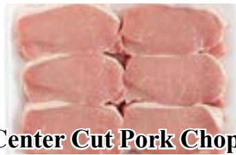
Center Cut Pork Chops $1.99 lb