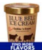
BlueBell Gold Rim Pints $3.09

Customer Services: Money Orders, Gift Certificates, Postage Stamps, Checks Cashed, Full-Service Deli