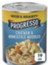
Progresso Soup Asst. 18.5oz-19oz $1.98