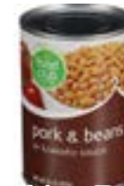
FDC Asst Beans 15.25oz $0.88