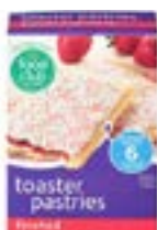
FDC Toaster Pastries 6ct $0.98