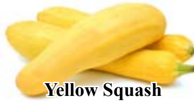
Yellow Squash $1.39 lb